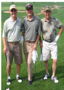
Course Information www.pgawest.com